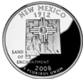
New Mexico Commemorative Quarter-Dollar Coin