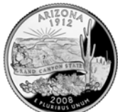
Arizona Commemorative Quarter-Dollar Coin

Third Quarter Fiscal Year (FY) 2008 Financials: FY 2008 third quarter total revenue declined four percent from the same quarter last year. Circulating revenue decreased by 30 percent, and numismatic revenue decreased by 13 percent, while bullion revenue increased by 294 percent compared to third quarter FY 2007 revenues. FY 2008 year-to-date total revenue was one percent above FY 2007 third quarter cumulative revenue.