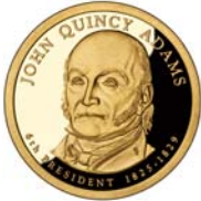
John Quincy Adams Presidential $1 Coin